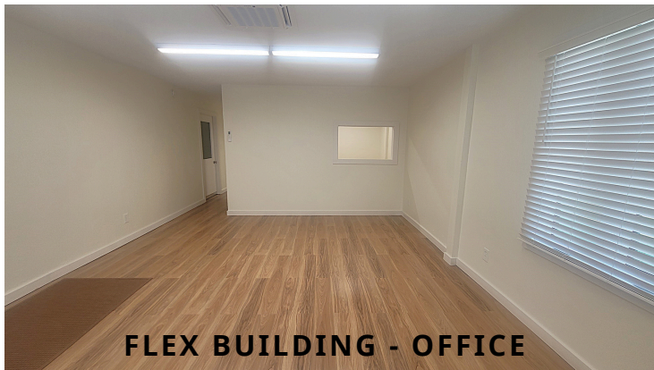
FLEX BUILDING - OFFICE