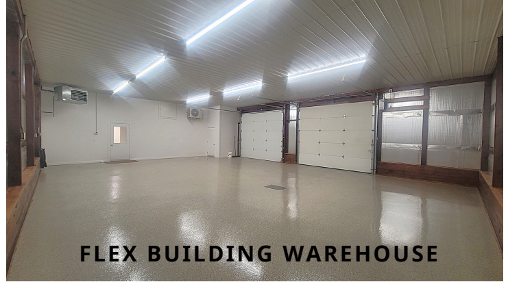
FLEX BUILDING WAREHOUSE