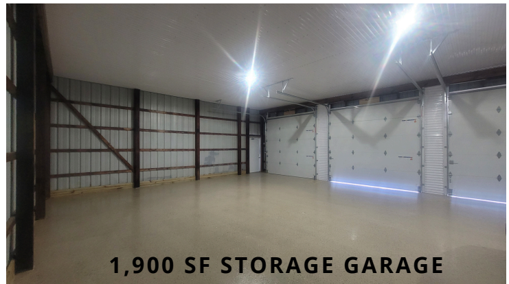
1,900 SF STORAGE GARAGE