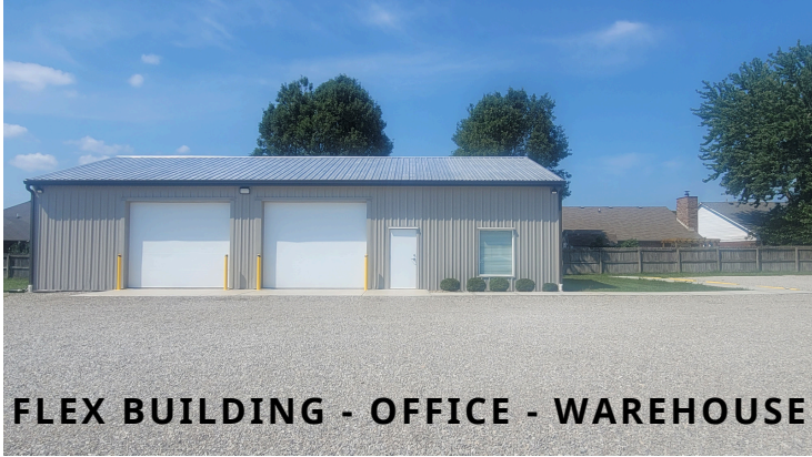
FLEX BUILDING - OFFICE - WAREHOUSE